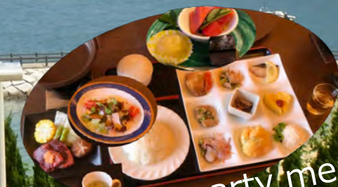
Dinner party menu of a day on July